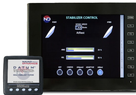
DATUM™ graphical display panel options, each with intuitive multi-page display screens.

Naiad Dynamics stands behind every system sold with its superb Limited Warranty. NAIAD® products are supported worldwide by our seven sales and service centers and mobile fleet, and by our comprehensive Authorized Dealer Network with locations in key regions for fastest response and guaranteed satisfaction. Spare parts are usually in-stock and ship within 24 hours, and our state-of-the-art in-house manufacturing facility ensures quick turnaround on parts throughout the life of the system.