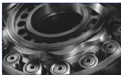
Internal Galaxie and Cycloidal Drive Gearing