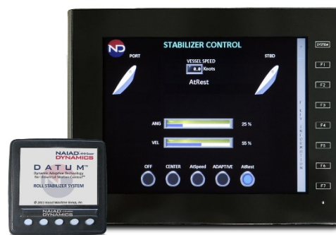
DATUM™ graphical display panel options, each with intuitive multi-page display screens.