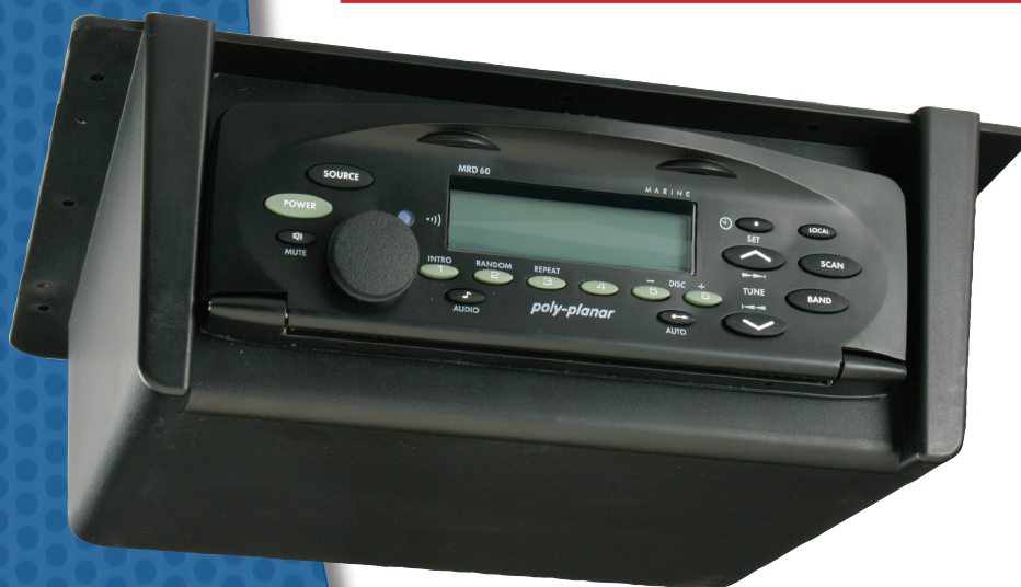
Shown with MRD-60 Stereo (not included)

This rugged enclosure is designed for under dash or overhead mounting. The RM-10 comes with mounting screws and self adhesive gasket tape.