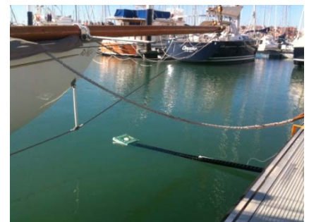
DUMO Algacleaner installation