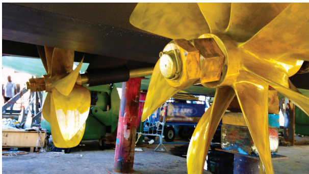
PropOne™ applied to a twin shaft drive

PropOne™ is a non-biocidal foul release coating which prevents sealife adhering to it. It has been developed to ensure increased vessel performance due to its slick nature and excellent corrosion protection.