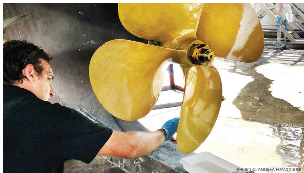
PropOne™ helps maintain maximum performance