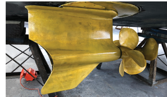
PropOne™ applied to a Volvo IPS™ unit