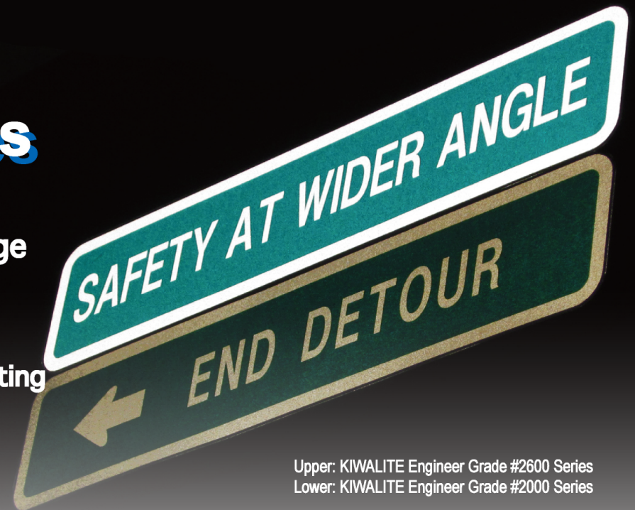
Upper: KIWALITE Engineer Grade #2600 Series Lower: KIWALITE Engineer Grade #2000 Series