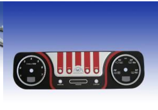
Example: InMouldDecoration ( IMD)