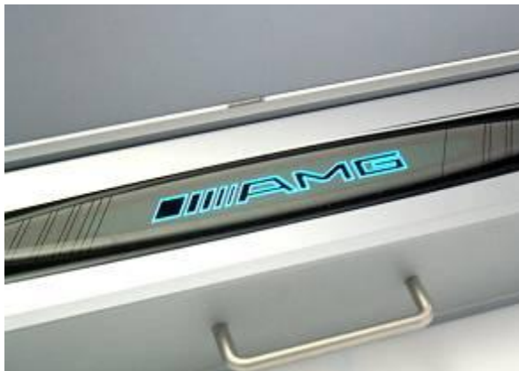
Example: Illuminated door sill

The success of the company confirms this concept.