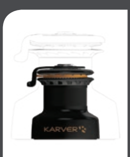
Size with equivalent power.

Total concentrated innovation in a two-speed self-tailing winch. By transposing the technology of its 4-speed winches, Karver invented the most powerful small winch.