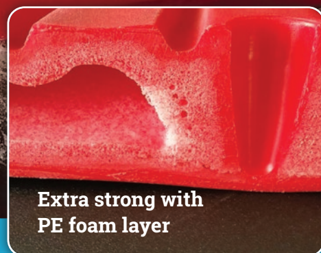
Extra strong with PE foam layer