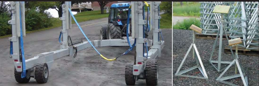
Galvanized Boat Stands