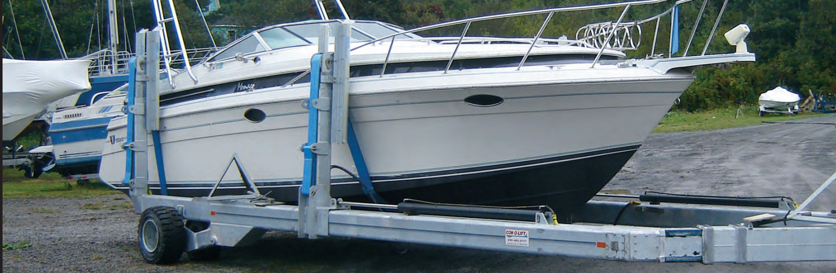
SLING LIFT TRAILERS