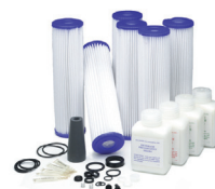
Extended Cruise Kit

Katadyn reserves the right to modify products