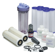
Preventative Maintenance Kit