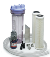
Silt Reduction Kit

For waters with high levels of suspended matter, e.g. in shallow anchorage, we would recommend you use an additional prefilter. This additional filter is finer (5 microns - 1 micron = 0.001 mm) than the standard filter (30 microns) and is placed after it. A booster water pump (12V/0.8 A/h) is also provided. This pump compensates for the loss through the second filter and increases water production. We would also recommend the prefilter kit when the PowerSurvivor is not installed under the water line and when it is in constant use to increase the intervals between servicing.