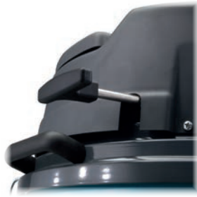
Ergonomic and effective filter shaker