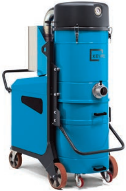
K7 K11S K13 K9 K11P K15