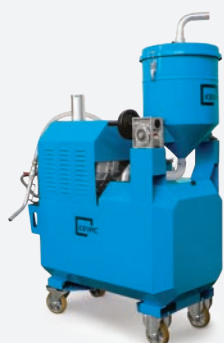
KOIL440T KOIL455T KOIL611T