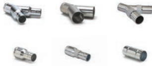
Reducers and hose fittings