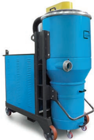
K20S K25S K20P K25P

Heavy-duty, silent, robust, effective: fitted with a soundproof, maintenance free, three phase side channel vacuum unit for continuous run use.