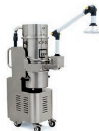
KF16.003 with extraction arm with hood