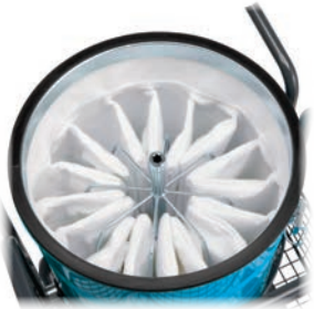
Large surface area star filter