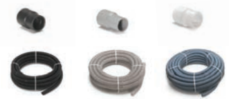
Sleeves and hoses