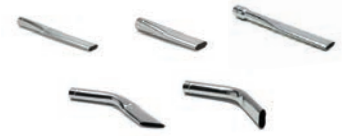
Zinc and stainless steel flat crevices