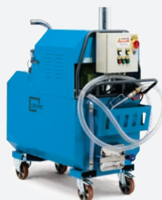
KOIL330 KOIL340 KOIL355