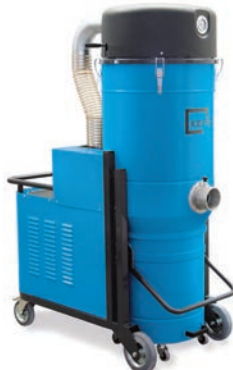
KB5XP KB7S KB7P