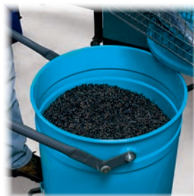
Innovative quick release mechanism for bin emptying

L-M-H filtration certification (for hazardous dust vacuuming)