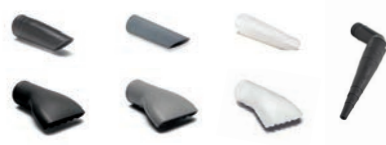
Rubber & silicone cones and suction nozzles