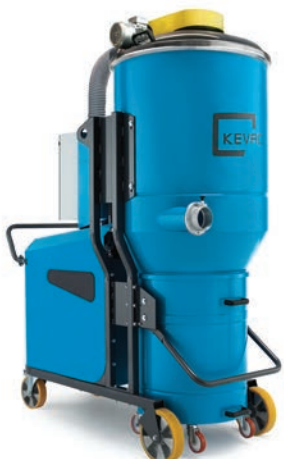
K7/78 K11P/78 K15/78 K9/78 K13/78 K18/78