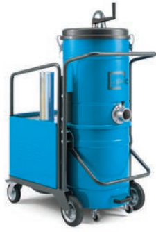
KB2 KB4S KB5S KB3 KB4P KB5P