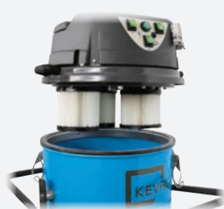
Water repellent polyester filter cartridges fitted onto a KMB3.069 and a KMB3.070