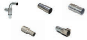
Other connectors, fittings and reductions