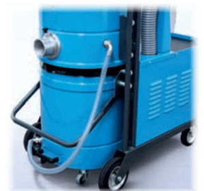
Disposal bag vacuum balance system for dust collection directly into plastic bags (as option)