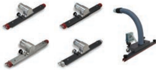
Fixed and mobile floor nozzles