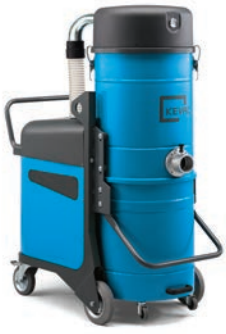
K2 K4S K5S K3 K4P K5P