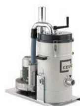
KH0528 KH1028 KH1036 KH1636 KH2236 KH2246 KH3046 KH3046P