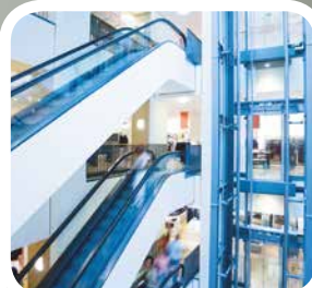
Retail parks & shopping malls