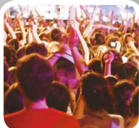
Sports stadiums & concert arenas