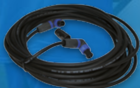
Extension cable 15 meters