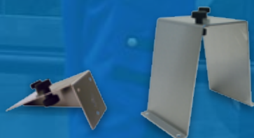
Mounting bracket cable reel