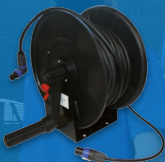
Reel with swivel and stainless steel mounting bracket equipped with 25 meters cable