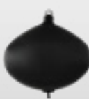
Ø 430 mm Weight: 1,1 kg Réf. S60