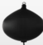
Ø 700 mm Weight: 2,6 Kg Réf. S100