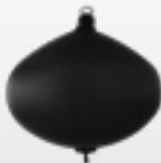
Ø 500 mm Weight: 1,5 Kg Réf. S70