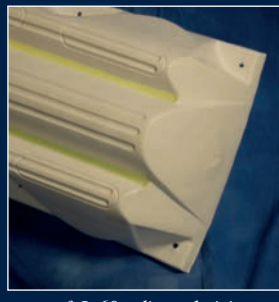
\it ref.\ L.60-diurnal\ vision

For the new innovative line of patent pending E.V.A. phosphorescent bumper to solar Energy. The E.V.A. phosphorescent bumper are charged by daylight and will stay bright for five to eight hours. The E.V.A. phosphorescent bumper will have a long lasting capacity to safely guide all vessels into the marina in the darkness of the night. The phosphorescent effect will last more than 5 years.