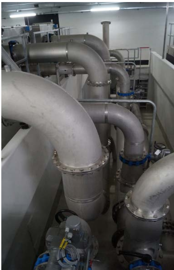
Fig. 7 Pipe basement

The public utilities' plan envisaged that the existing buildings would be reused to a large extent since they were in good condition. The largest building contained the open filter system, which was taken out of service once the new pressure filters had been commissioned. The space above the filters, partially recessed into the floor, was more than enough ( Fig. 6 ) to house both the deacidification systems and the nanofiltration systems. Demolition of the solid concrete walls was deemed infeasible for reasons of cost. These walls were obviously buttressed since one filter was converted into a pipe basement ( Fig. 7 ). Holes needed to be drilled in or cut out of concrete walls about 1.5 m thick, which involved not inconsiderable effort. An end-to-end bearing structure made of structurally dimensioned steel girders was installed over the filter walls to house the system compo-