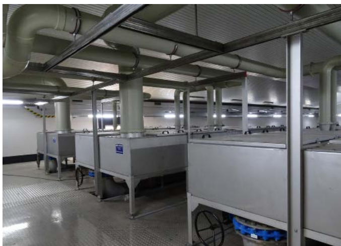
Fig. 5 Flatbed aerator