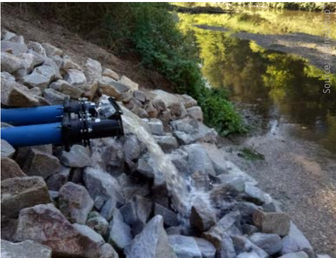
Fig. 2 Retentate discharge