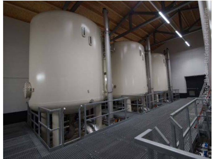
Fig. 3 Pressure filter system

Retentate disposal posed a particular problem. In a normal situation, retentate was discarded into a receiving water course via a direct discharge. In Sandweier, the Sandbach brook, about 1.8 km away, was the only option in this case. Discharge of this type was not possible or was not approved for PFC-contaminated retentate. After a highly complex approval procedure under water resources law, a retentate treatment process was defined based on activated carbon in the reverse osmosis downstream. This needed to be taken into account as another factor in plans. Two parallel pipelines were provided to ensure that the retentate discharge could continue to operate in the event of a malfunction and repairs (Fig. 2).