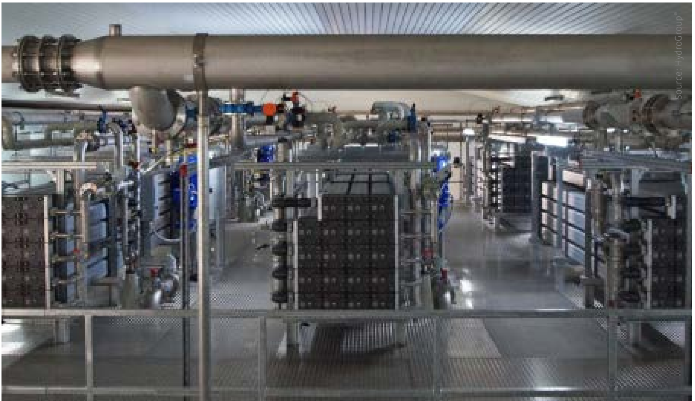
Fig. 1 LPRO system

The municipal utility company needed to expand its existing concept plan for a groundwater softening facility to include a low-pressure reverse osmosis system to reduce PFCs. This required a significant increase in treatment capacity and, consequently, filter performance to ensure that drinking water supply would be available even if there was a breakdown.