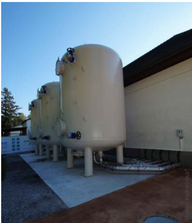
Fig. 10 Activated carbon filter to treat retentate

the raw water feed to the systems beneath the bearing structure and the pipelines for permeate, retentate and CIP above. Optimally efficient vertical centrifugal pumps have been fitted and operate via frequency converters.