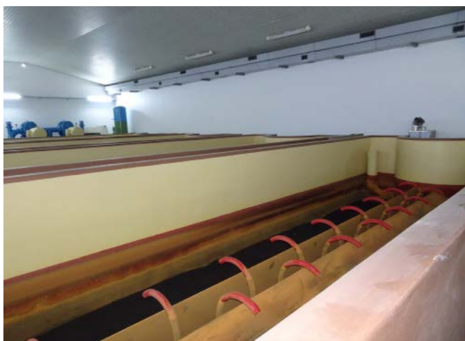
Fig. 6 Open filter system

an overall throughput rate of 1,350 m 3 /hour. The filter systems feed the two-chamber pure water tanks with a total capacity of 1,200 m 3 , from which water is conveyed to the central Tannenweg and Annaberg elevated tanks. The water quantity required per flushing process is also taken from the pure water tank. The backwash water ends up in a sedimentation tank.