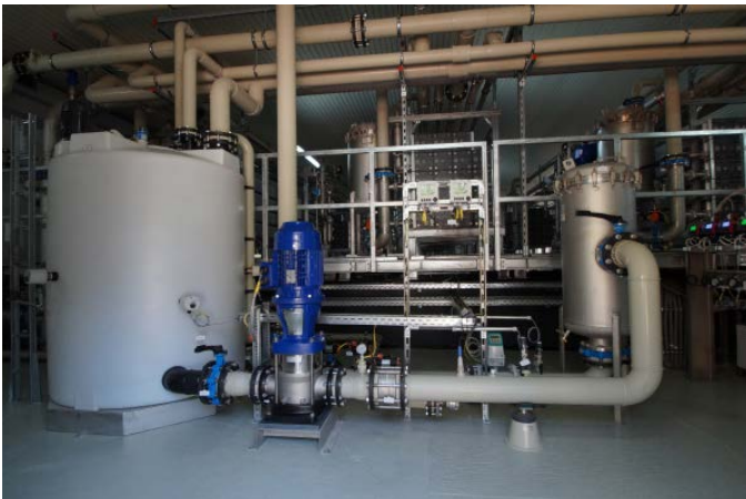
Fig. 8 CIP station