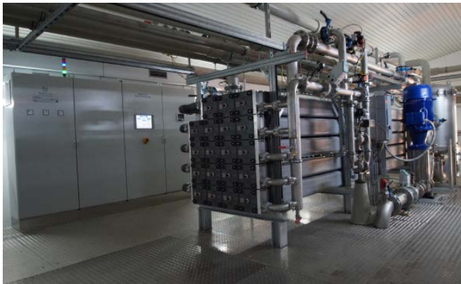
Fig. 9 LPRO rack with switchgear assembly