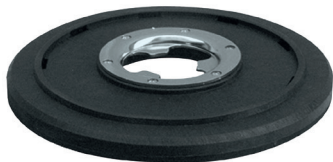
Pad holder Item no. 201.004