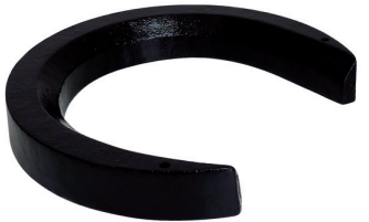
Additional 14 kg weight. Item no. 201.068