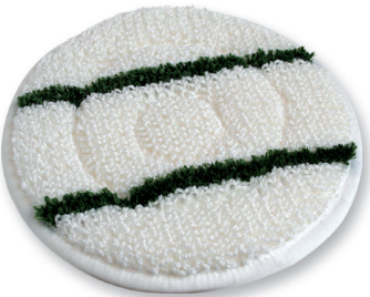
The Queen Bonnet pad for the best cleaning results on carpets and carpeted floors. Item no. 201.009