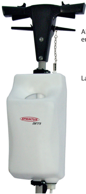
All controls are situated at the ergonomic handle.