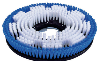
Brush soft Item no. 201.003