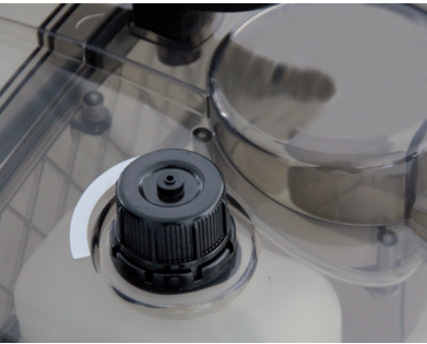
A separate tank allows for the use of anti-foaming agent and guarantees problem-free work.