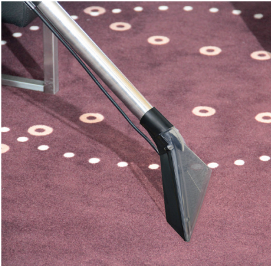
The floor spray nozzle with a long vacuum tube for convenient carpet cleaning.