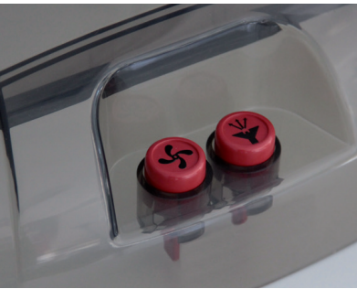
Spray-and vacuum-function are separately switchable at the device.