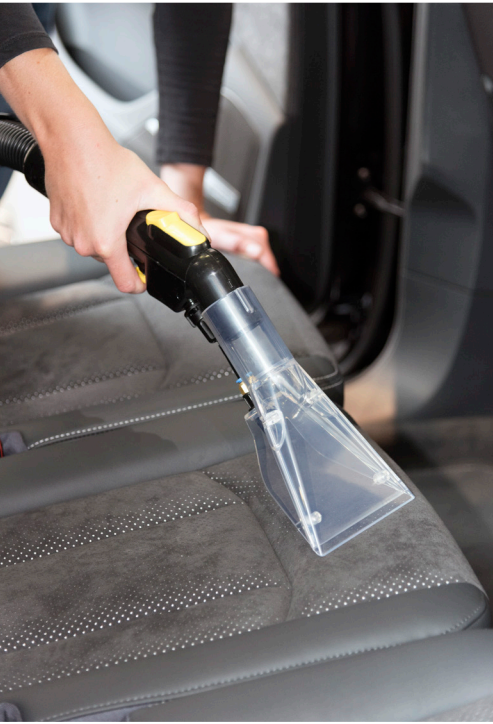
Clear upholstery nozzle for cleaning vehicle seats etc. The spray function can be adjusted via the operating lever on grip.