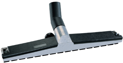
Accessory: Extremely robust metal floor nozzle 450 mm. Item no. 102.051