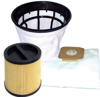
In addition with a fine dust cartridge and a fleece filter bag a extra high filtration rate is guaranteed.