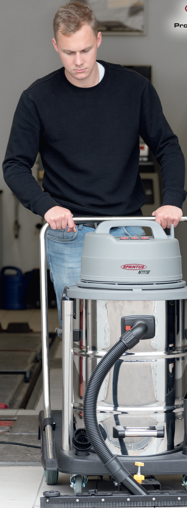
Pic. shows optional gangway nozzle Item no. 103.010