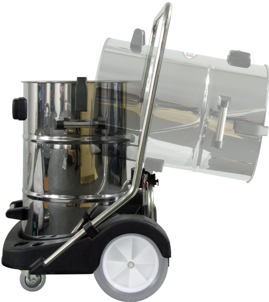
Standard kit: tilting function allows an ergonomic emptying.

The professional vacuum with a fine dust filter cartridge, fleece filter basket, and complete accessories. Extremely high performance and easily adaptable due to its three individually-adjustable turbines. The N 77/3 E is an especially robust stainless steel wet- and dry-surface vacuum cleaner and was conceptualized for excessive use. The convenient container tilting function enables fast and handy emptying. The sturdy undercarriage with metal casters and large rubber-coated wheels ensures problem-free work, even on sensitive surfaces. Also available is an optional 650 mm gangway nozzle for wet surfaces, which can be mounted on the undercarriage of the N 77/3 E and operated from the backside of the device.