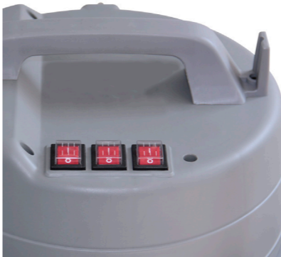
Three individually adjustable turbines for simple adaptation of the suction power.