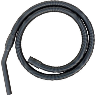
Accessory: 3 m antistatic suction hose. The hose is electrically conductive and ensures optimum discharge of any electric charge via the grounded body. Item no. 102.116