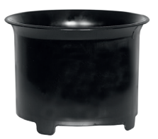
Standard: zyklon unit Item No. 109.057