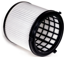
Standard: EPA12 fine dust filter cartridge Item No. 109.058