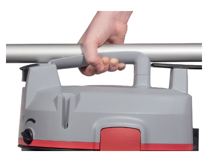
Maximum ergonomics: with a weight of only 4,5 kg, the Floory can comfortably be carried with one hand.