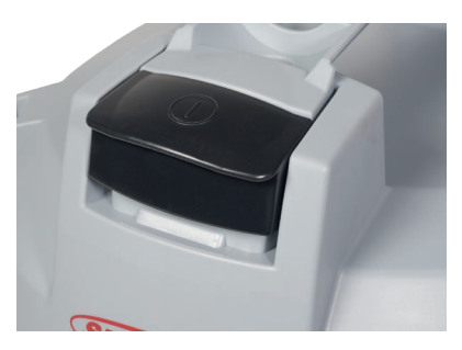
Large foot switch for turning on and off without bending down.