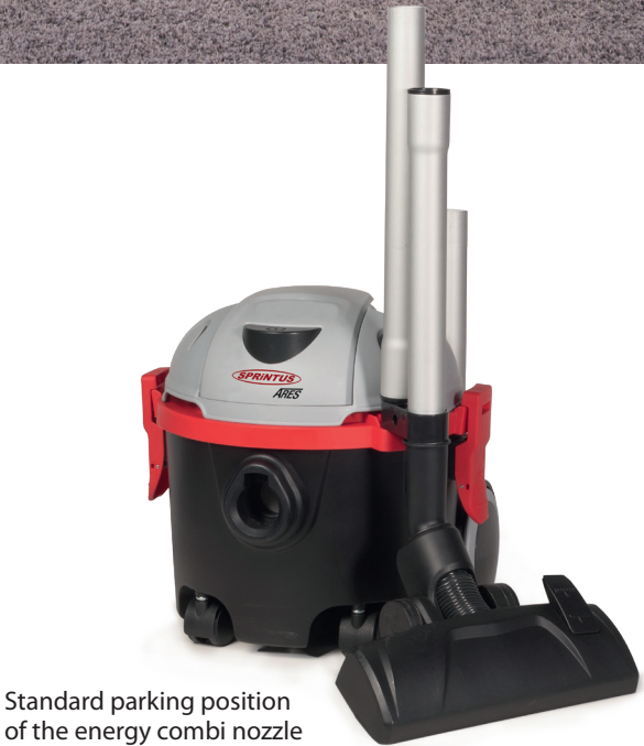
Standard parking position of the energy combi nozzle

The SPRINTUS ARES, the compact entry-level model of the SPRINTUS enery dry vacuum cleaners, convinces with ist agility and quality, which clearly distinguish the ARES from other entry-level vacuum cleaners. A high suction power and an efficient 700 watt engine are must-haves for SPRINTUS vacuum cleaners and allow the compact and reliable ARES to be a dynamic partner in the professional cleaning industry. Part of the extensive equipment are high quality aluminium poles, which are in accordance with the high SPRINTUS quality standards. The robust, 2 m long Memory-Flex vacuum hose and a 8 m power cord, ensure a operating radius of 10 m. Due to the standard 2in1 crevice and upholstery nozzle, even hard to reach places and delicate areas can be cleaned. Thanks to ist compact size and extensive equipment, the SPRINTUS ARES is a versatile dry vacuum, which can take on even larger cleaning challenges.