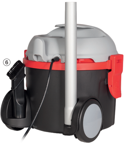
Two parking positions at the back of the machine for the crevice-/upholstery nozzle or the aluminium poles