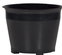
Cyklon unit Item No. 116.115

Due to the twist of the intake nozzle, the spray-fog is consequently diverted along the inner container wall. Additional filters are no longer necessary. The reliable floater system even reacts during heavy foam growth. Cooling air slots located on the side ensure the consistent separation of cooling and processed air.