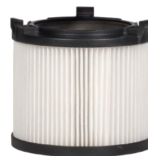
HEPA 13 fine dust filter cartridge Item no. 116.106