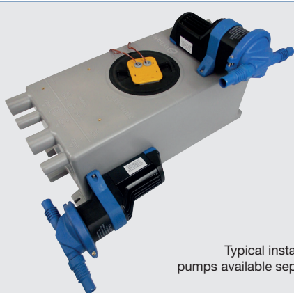
Typical installation- pumps available separately

Ideal for larger vessels with many outlets, dishwashers or even bathtubs on board