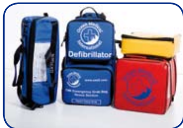
OMI MCA Class B for 10