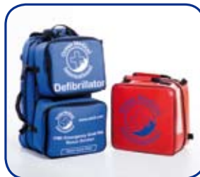
OMI Weekender MCA Class C (6 hr) for 10