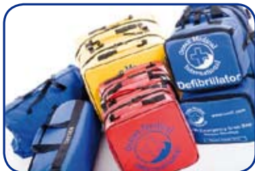
OMI MCA Class A for 10