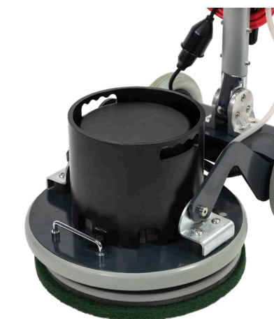
Optional additional weight, 12 kg Item no. 207.119