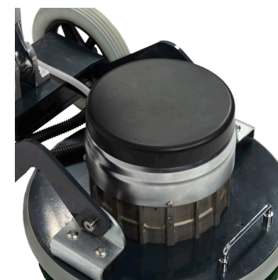
Motor protection cover protects the motor from moisture.