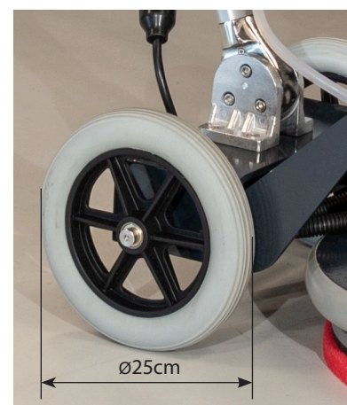
Excellent stairway mobility and stability.