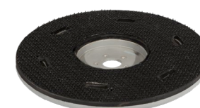
Pad holder Item no. 207.113