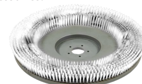
Brush medium Item no. 207.115

Disc pads for each surface in different degrees of hardness.