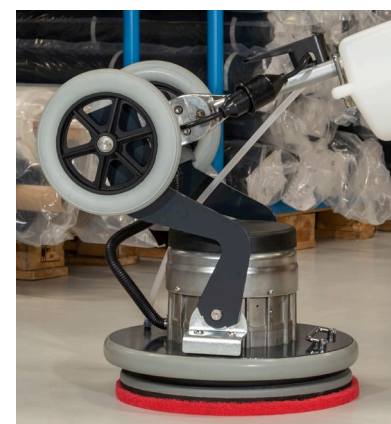
Tilting drawbar for increasing the contact pressure.