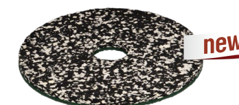
Power Pad for all surfaces Item no. 201.076