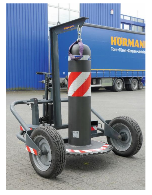
Image 5: Hörmann offers the additional transport aid OktaMover. This allows mobile vehicle barriers to be quickly and simply moved without using motorised special vehicles.

Image 4: By means of a transport aid that can be screwed into the bollard cover, the individual barrier, which does not involve any assembly work, can be easily put into position with a crane or forklift truck, and installed and removed without special technical knowledge.